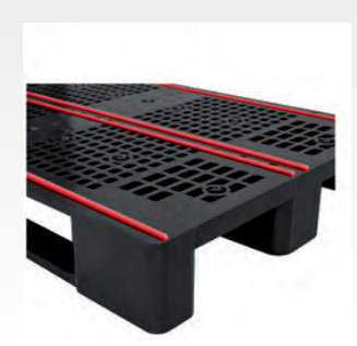
Possibility to insert 3 or 4 metal reinforcements for a major load capacity in rack up to 1250 kg.