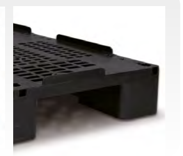
Outer rims from 7 to 22 mm, upon request, to provide safe handling applications.