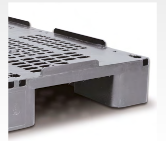
Outer rims from 7 to 22 mm, upon request, to provide safe handling applications.