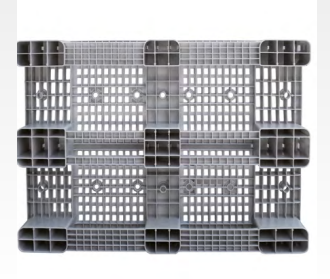
Perforated surface to facilitate its cleaning.