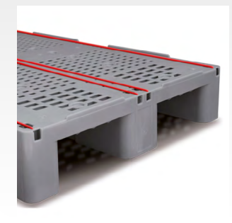
Possibility to insert 3 or 4 metal reinforcements for a major load capacity in rack up to 1250 kg.